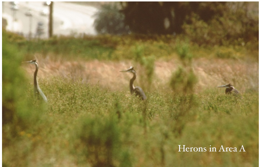
Herons in Area A

“On Friday, March 26 (2010), the Los Angeles City Council sweetened Goldman Sachs’ pot—substantially. In a vote of 12 to 2, with Westside council members Bill Rosendahl and Paul Koretz opposed, the council handed the big firm significant additional development rights on 111 acres of property it co-owns at Playa Vista. The vote allows Playa Vista’s final build-out phase to dispense with land-use rules that permitted just 100,000 square feet of commercial space---about the size of a single Costco warehouse—to allow about 2.6 million square feet of